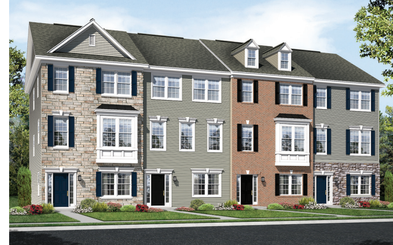
Elevation H, A, G, D

Approx. square feet: 1,950 Stories: 3 Bedrooms: 3 - 4 Garage: 2-Car Plan Number: M19K