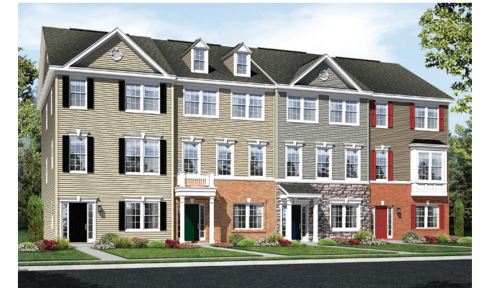
Elevation B, E, F, C

The Kimberly plan offers three floors of generous living space. On the main floor, an open dining room and spacious living room flank a charming kitchen with a roomy center island and optional gourmet features. Upstairs, enjoy a convenient laundry, a full bath and a relaxing master suite with an optional deluxe bath. The lower floor boasts an expansive rec room, which can be optioned as an extra bedroom.